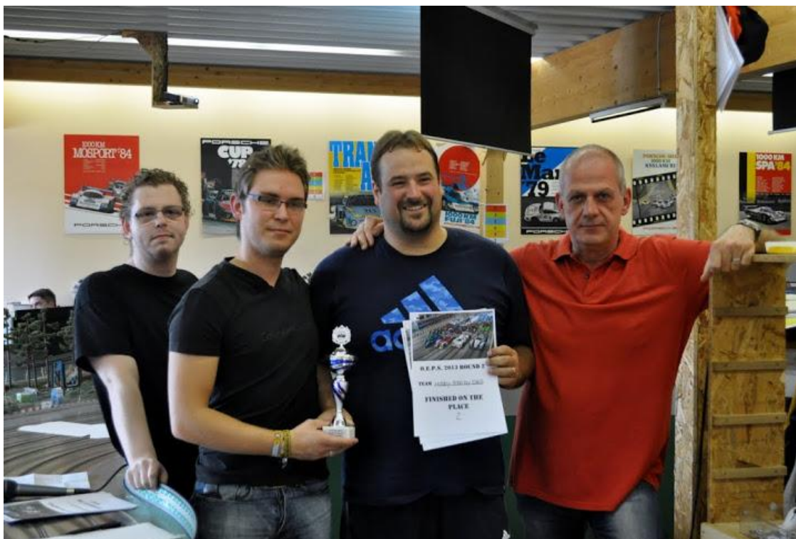
3rd overall - Hobby2000 DG