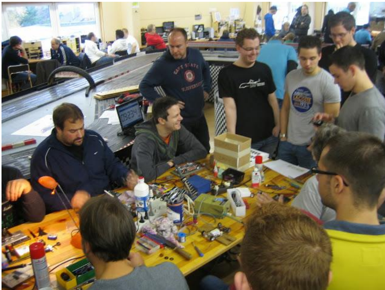
Handout at Saturday morning

All the teams were perfectly organised to get the motors and built in on Saturday which was very much appreciated by the organisation. A big 'thank you' to the teams.