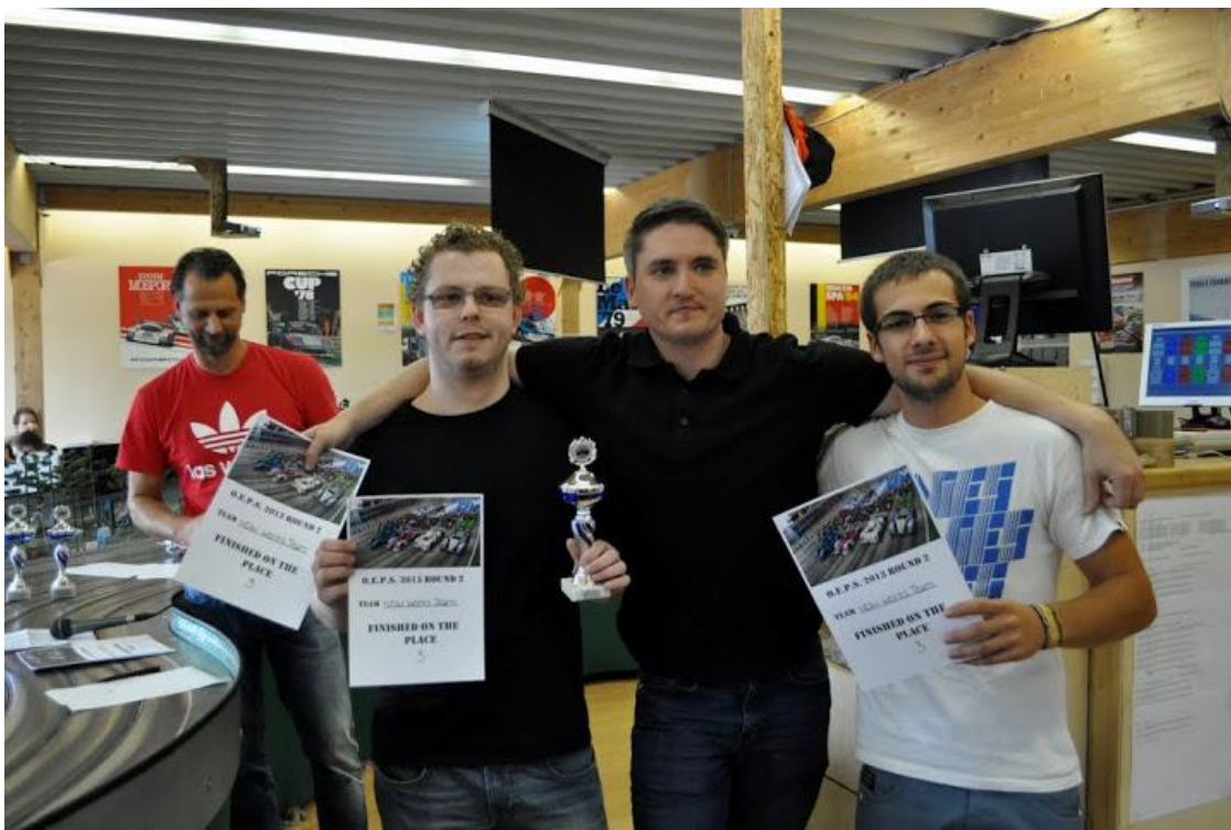
2nd overall - NDW works team