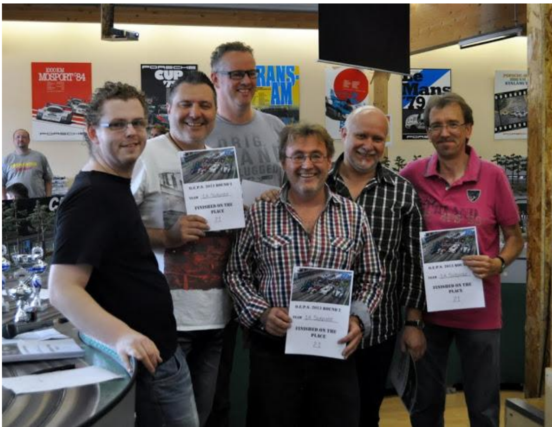
Winner GT class - 1A Slotpiste