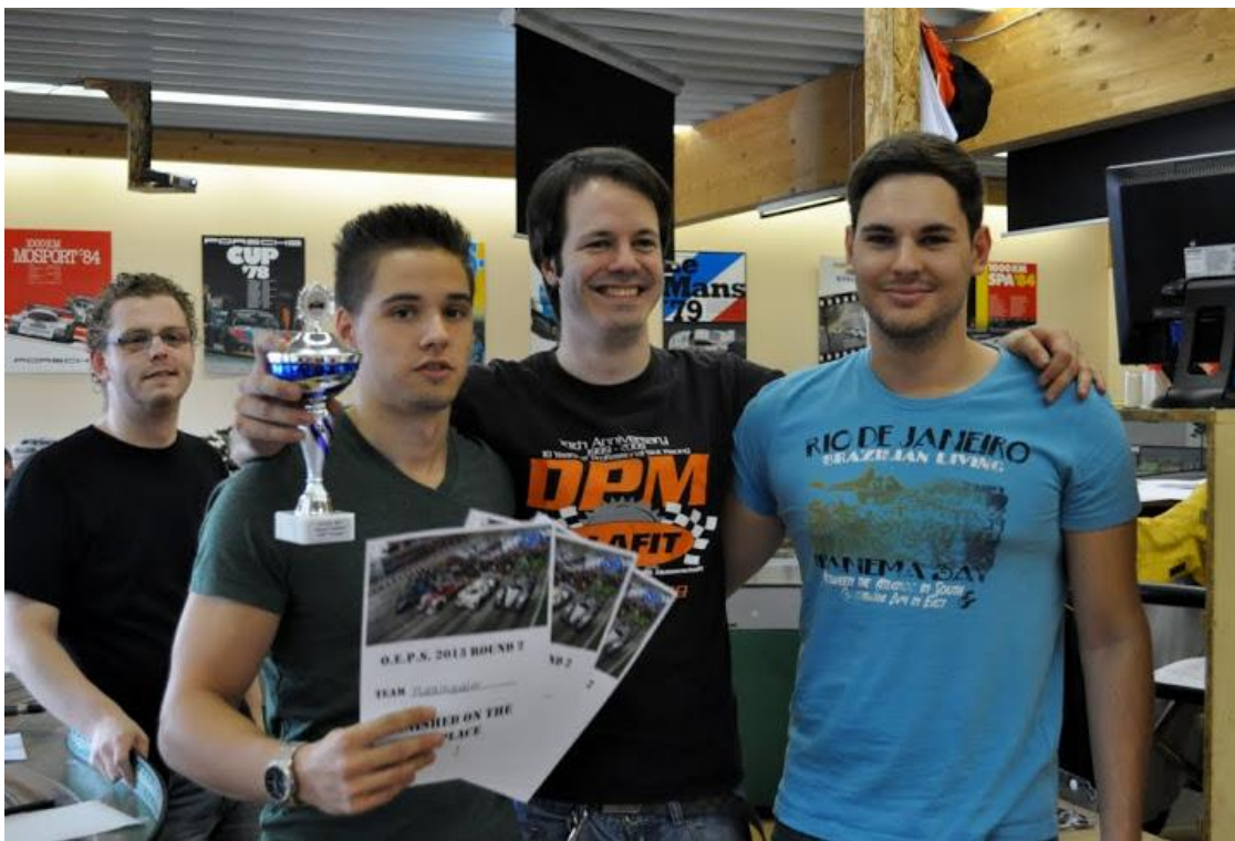
Winner overall - Plastikquäler