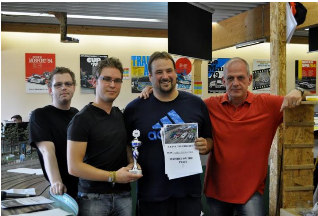
2nd overall - Hobby2000 DG