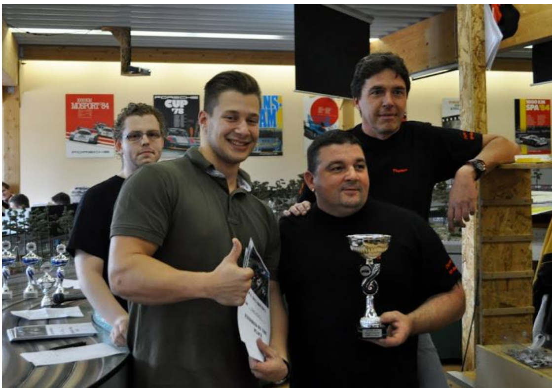
Winner LMP2 class - Nemesis